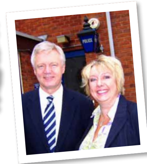
Conservatives believe in personal responsibility.