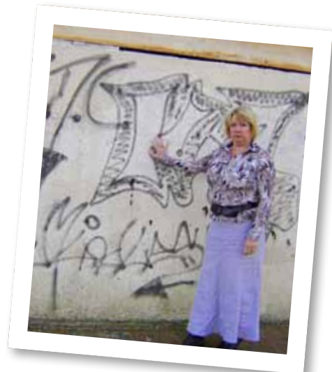
Crime affects the environment.