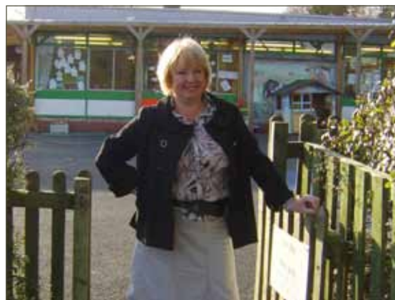
As Chairman of Governors I know what we could do with more funding.

Worcestershire is one of the worst funded authorities in the country and every year the budget at schools is a huge issue for heads and governors. Only just up the road in Birmingham each school receives over £500 more per pupil. Just think what we could do with that!