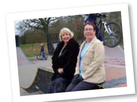
Youth facilities reduce crime.