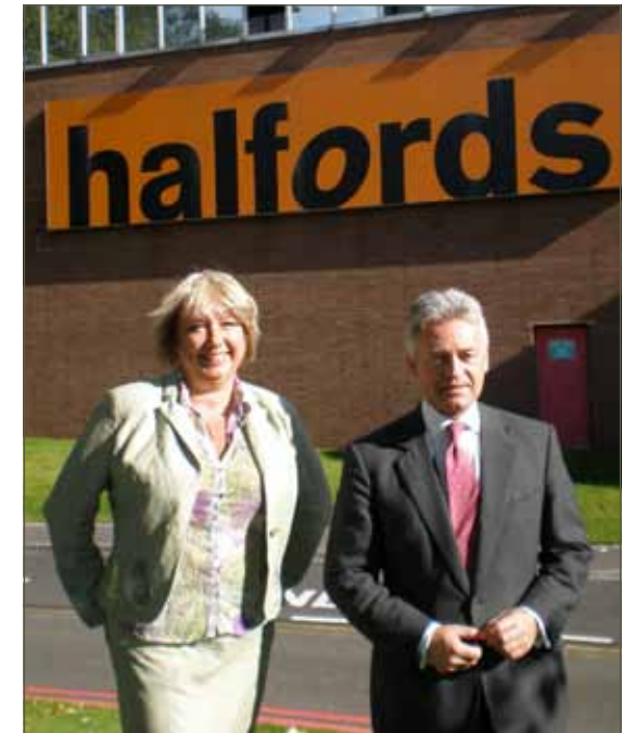
A deteriorating economy means tough times ahead.

Our location in the country and great road links make Redditch an attractive place to relocate and in this very difficult climate we need all the help we can get.